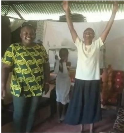
Joy! Joy! Joy!

Your gift of a dry, safe home gave them relief and JOY! Jumping up and down joy!