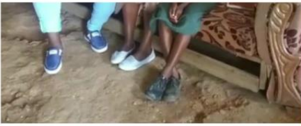
Holey Dirt Floor!

When the rains come, so does the flooding in her home!