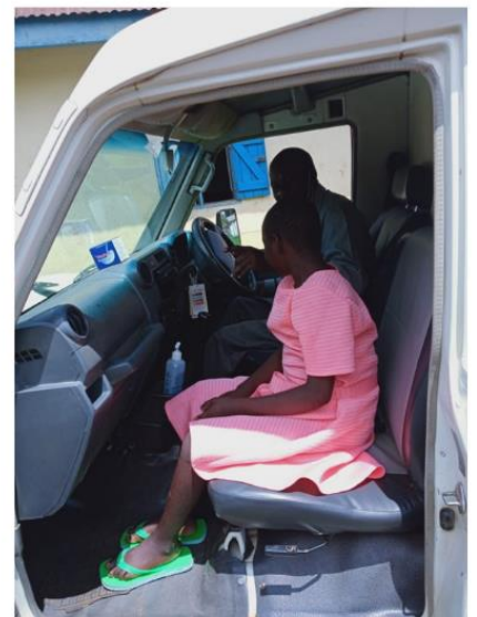
Off to a Recovery Center