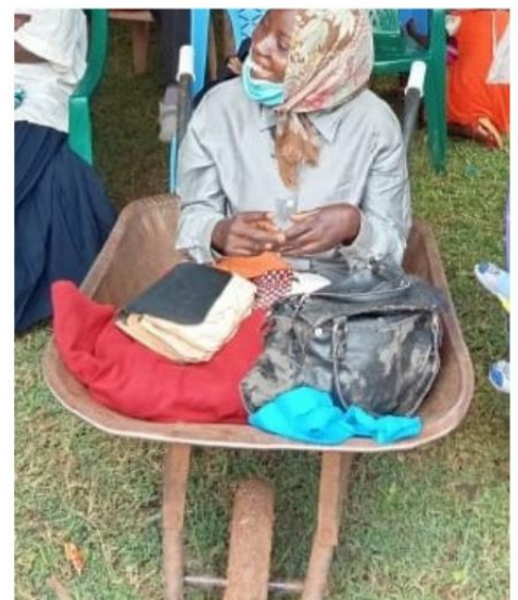
From Limitations to Freedom