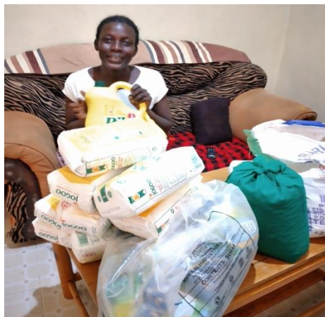
Relief Has Arrived!