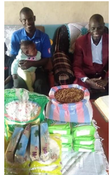
You're the answer to prayer!

Your generous donations were their answer to prayer and gave us the blessing of delivering food in these difficult days as families struggle through the impacts of COVID.